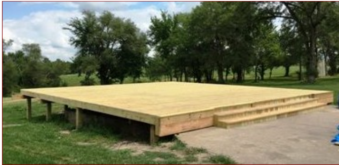
The new Pavilion deck with a panoramic view of the Center.

I am not sure at what point the other two leaders decided to move to the other side of the shed, but it wasn't very long. What felt like a few seconds, I turned around and looked out the window from the door and I saw that the roof had blown off of the shed. I thought, "Wow, I had just made it in time. I could have been hit in the head with a flying roof." I opened the door immediately and saw that the entire shed had fallen. Of course I was concerned for my teammates. Apparently, they had gotten out with only a small cut and thank goodness, no one was seriously injured.