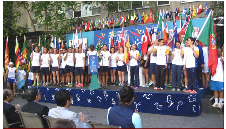
Flag representatives from over 40 countries share at the NYC Peace Run.

unflinchingly and unmistakably claim that loving and fulfilling peace is our birthright.”